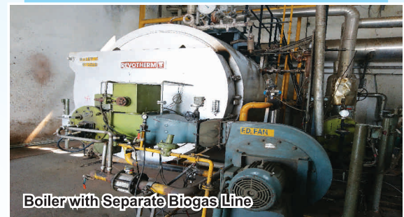
Boiler with Separate Biogas Line